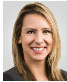
Ruth Ellen Brosseau

Churchill - Keewatinook Aski (Manitoba) Critic, Jobs, Employment and Workforce Development.